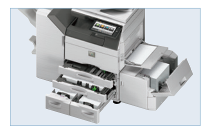
Provides up to six paper sources for a maximum paper capacity of 6,300 sheets.