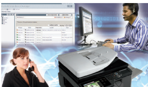
Sharp Remote Device Management