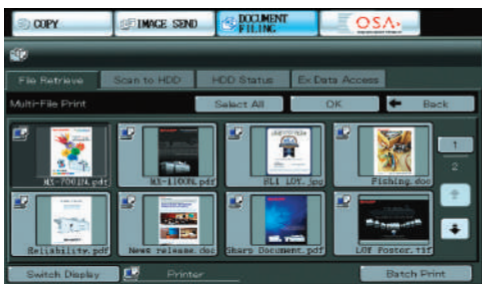
Sharp's easy-to-use Document Filing System with thumbnail preview