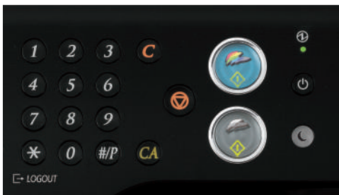
Separate print buttons for B&W and Color allow users to selectively manage use of color

Managing all of the advanced features of your Sharp product is simple and easy. Ask your Authorized Sharp Dealer about the My Sharp website . This dedicated customer training website is customized to your MX-2615N/MX-3115N and allows you to locate resources and find information specific to your configuration, truly helping you maximize your investment.