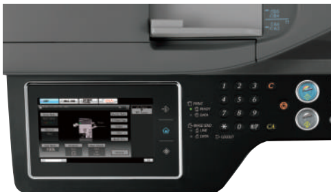
High-resolution touch screen with Stylus pen for easy point-and-touch operation