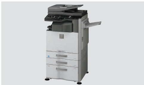
Available paper capacity stores up to a maximum of 3,100 sheets with options