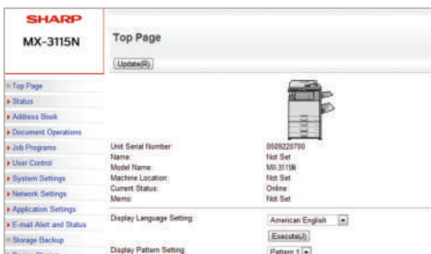
Embedded web page